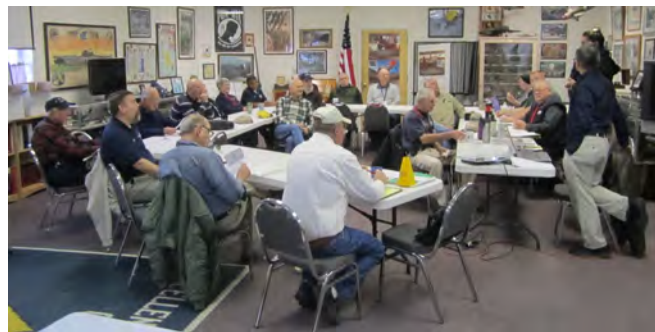
A Great Turnout!